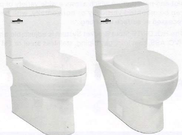
ICERA Malibu II Back-Outlet and 10" Rough-in Toilets

Creating a modern farmhouse home is about creating a space where you feel happy and relaxed. Its unexpected style is modern and paired down but captures the comforts of an old home with a good soul. Mixing vintage and new elements together and adding interesting architectural elements and textures develops a singular space that speaks to individual history and style. ●