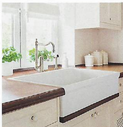
Lenova Fireclay Farm Sink with SK301 Kitchen Faucet

Measuring a generous 30 inches by 20 inches by 10 inches, the sink is available in Black, Bisque and White and comes with a stainless steel strainer and protective grid. www.lenovasinks.com