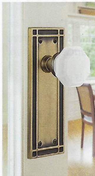
Nostalgic Warehouse Waldorf White Milk Glass Knob with Antique Brass Craftsman Long Plate