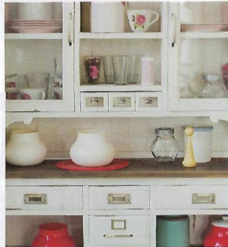
Atlas Homewares Campaign Collection

Atlas Homewares brings a touch of Americana to its Campaign Collection that is very much at home in a farmhouse décor. Reminiscent of classic army trunks, these knobs and pulls have a clean industrial style that is equal parts modern and retro influences. They're perfect in a farm-style kitchen or to add character to a refinished hutch or armoire.