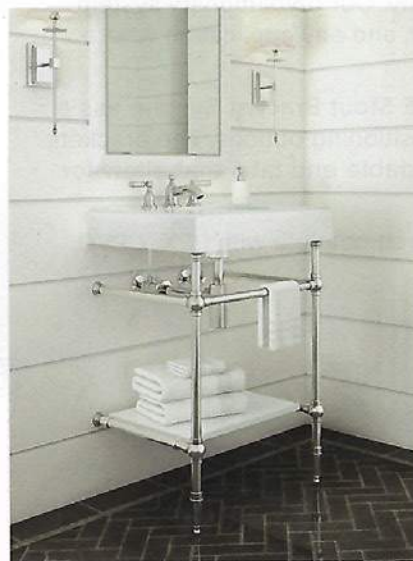
MTI Baths Boutique Collection Tops with Palmer® Legs