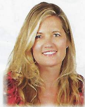
BY LINDA JENNINGS Kitchen & Bath specialist

Nostalgic Warehouse brings vintage-inspired milk glass back to the fashion forefront as the latest addition to its beautiful line of Waldorf knobs. This translucent glass was popular during the early 1900s as dishware and lighting