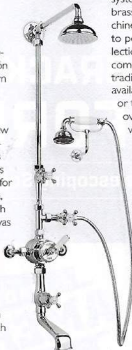
Barber Wilsons Exposed Thermostatic Shower

Today's version keeps the vintage style but adds modern conveniences such as an optional tub spout and hand sprayer. With perfectly proportioned volume controls and the adjustable shower riser and shower arm, bathers can modify the configurations to suit themselves perfectly. This exceptional shower is available in seven beautiful finishes, including Weathered Bronze and Brushed Nickel and Un-Lacquered Brass. www.sterlingham.co.uk