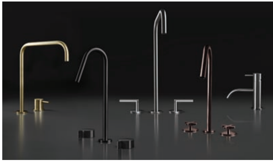
Blu Bathworks INOX tapware collection