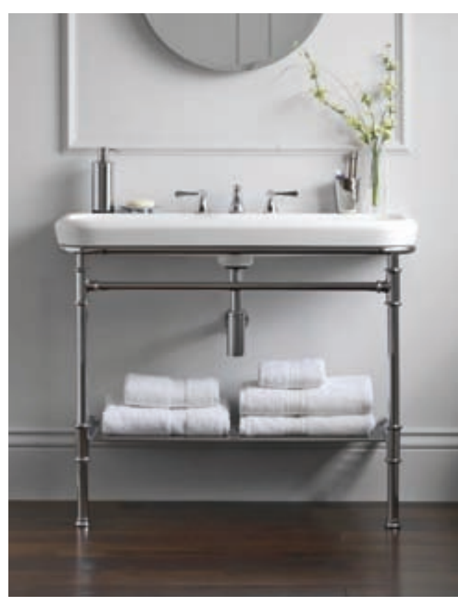
Victoria + Albert Metallo 100

The Candella washstand brings a touch of hotel chic to the bathroom with its elegantly sculpted legs, while the Metallo washstand sports right angle tee joints that look equally at home in a historic period bathroom or in an industrial-inspired theme. Both designs are available in two sizes and include a towel bar and a storage shelf in toughened glass to meet the demands of daily living. The washstands are topped with a basin crafted from ENGLISHCAST, the company's signature composite of volcanic limestone and high-