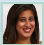
BY TINA RAMCHANDANI, KBB'S 2018 GUEST EDITOR

Last but not least, our guest editor shared some of her favorite interior design products with us - from lighting to plumbing fixtures to hardware.