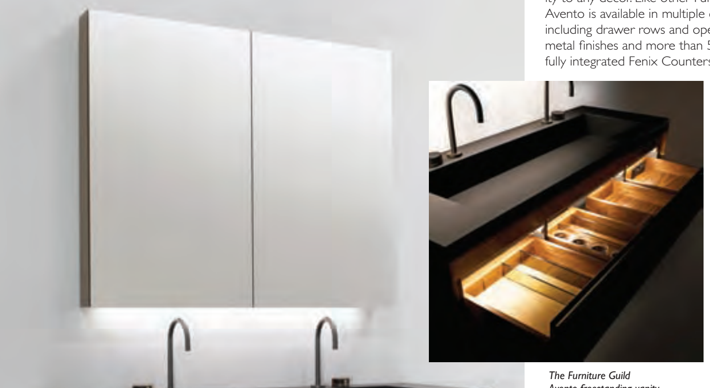
Avento freestanding vanity

wonderful opportunity to see the best of the global design industry up close and definitely a source for future inspiration. Here's to a successful 2018 fair and to the next 30 years! #