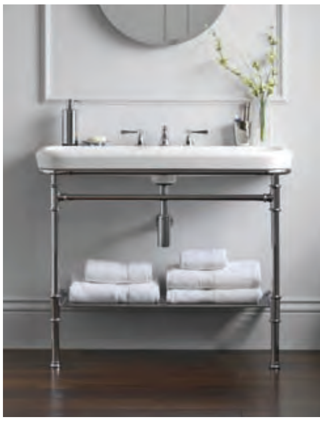
Victoria + Albert Metallo 100

The Candella washstand brings a touch of hotel chic to the bathroom with its elegantly sculpted legs, while the Metallo washstand sports right angle tee joints that look equally at home in a historic period bathroom or in an industrial-inspired theme. Both designs are available in two sizes and include a towel bar and a storage shelf in toughened glass to meet the demands of daily living. The washstands are topped with a basin crafted from ENGLISHCAST, the company's signature composite of volcanic limestone and high-