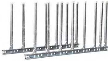
Weha Buffalo Slab Bundle Storage Racks

Weha Buffalo Bundle Slab Storage Rack design has created a six-point post touch locking system. While other slab rack bases touch the pole in one or two places, the Weha Buffalo Slab Rack base creates six different pressure points on the post. This design increases the metal to metal contact from a standard 4 ½ to over 9 ½ inches, doubling the surface contact.