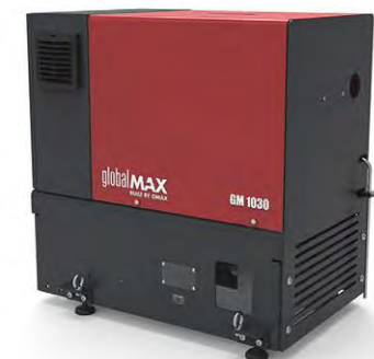
10HP pump for the Omax GlobalMax JetMachining Centers