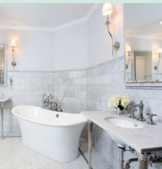
LEFT TOP This project by Normandy Design Build Remodeling features a freestanding tub by Victoria + Albert and dimensional floor tiles.