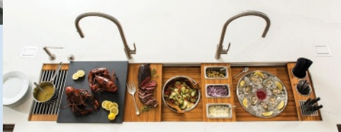
LEFT BOTTOM McMahon says The Galley Ideal Workstation is showing up in many of his kitchen projects. Homeowners can use it to prepare, serve, entertain and clean up, and it is available in six lengths in single- and double-bowl configurations.