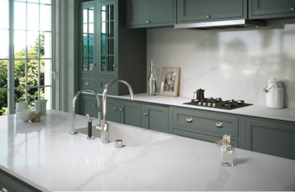
LEFT Shown is Silestone's Eternal Calacatta Classic countertop