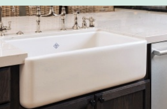
LEFT BOTTOM The Shaws Farmhouse Sink by ROHL is handcrafted in Darwen, England. Each sink is hand poured, shaped and stamped with the name of the artisan who created it. Made from heavy-duty fireclay, the sinks are resistant to acids, alkalis and aggressive chemicals.