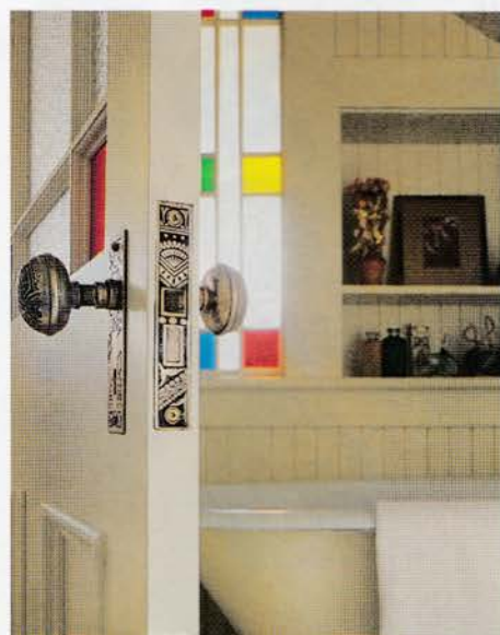
left Brass Aesthetic Movement-style hardware perfectly suits this original Queen Anne passage door in a late-Victorian house.

The era's hardware (and lighting, too) fits comfortably in a range of house styles. Rustic black strap hinges, for example, are equally at home in a half-timbered Tudor Revival cottage in New Jersey and a Spanish Revival hacienda in California.