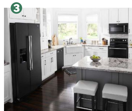
3 New finish inspired by iconic cast iron cookware from MAYTAG Circle 3 on inquiry card