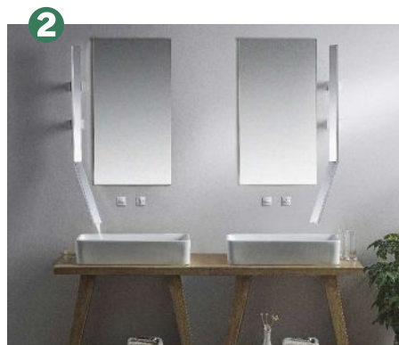
2 Dramatic wall-mount faucet makes big design impact from ISENBERG Circle 2 on inquiry card