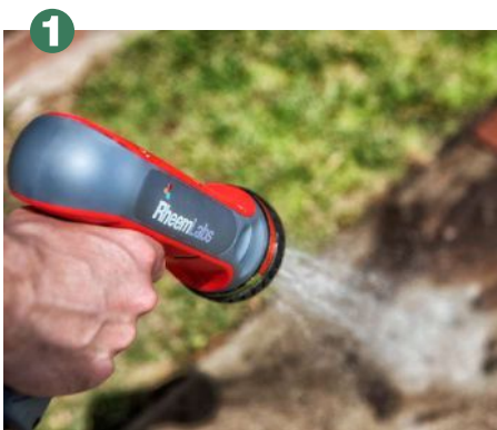
1 Hose sprayer supplies unlimited hot water to outdoors from RHEEM Circle 1 on inquiry card

These products had the most views in recent weeks. To learn more, go to QualifiedRemodeler.com and search the product or company name.