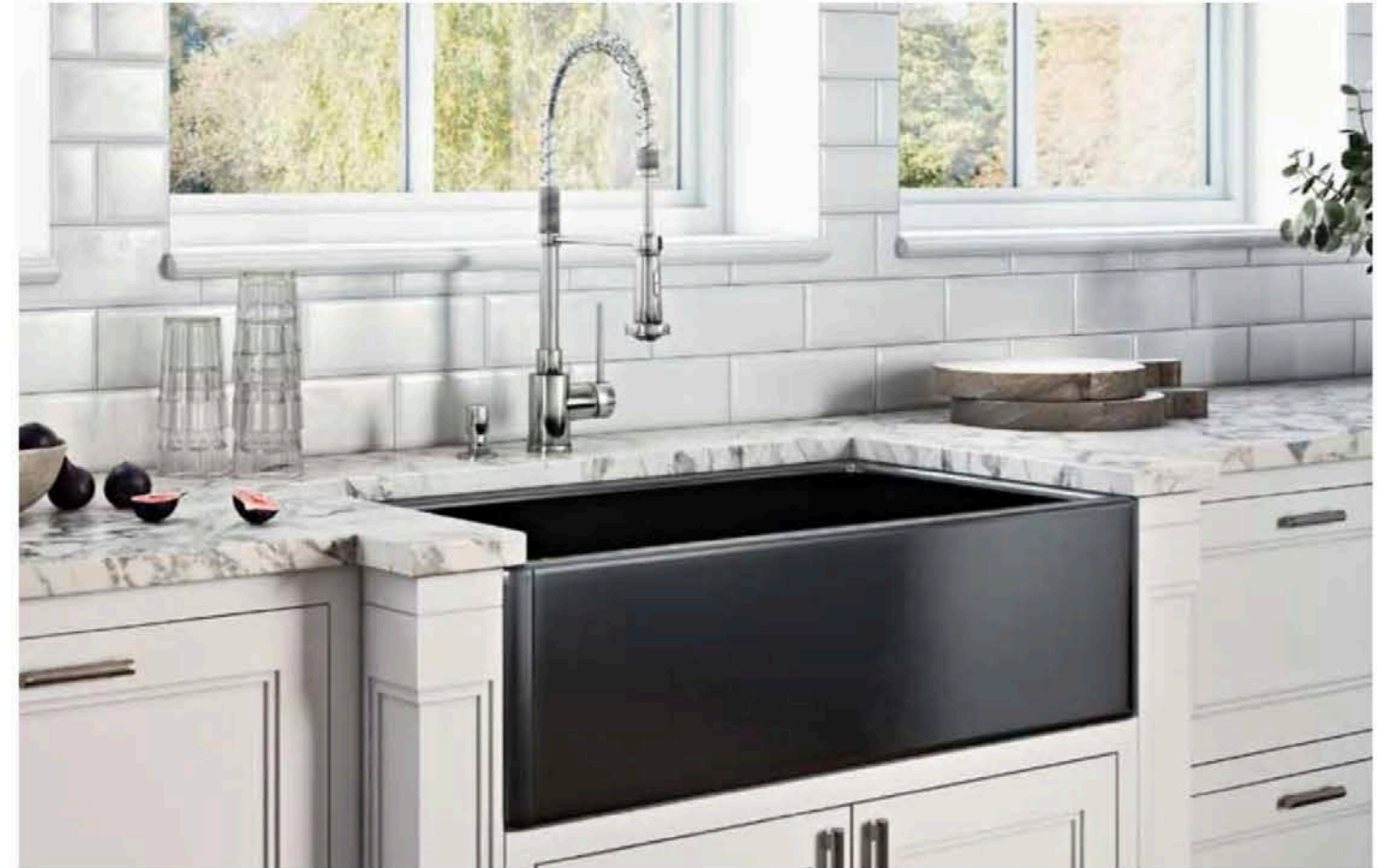
Fiamma Fireclay Sink in Black from Ruvati

highly efficient PVC drain body, the ShowerLine system creates a high-end look at a reasonable price and with no-hassle installation. Created with pre-sloped shower panels made from 100% repurposed materials, ShowerLine offers fast-and-easy retrofit solutions. It's perfect for a bathroom remodel to add a roll-in shower for maximum accessibility. The system offers an array of design options to work with nearly any finish or flooring material and provides a clean, modern look. As an ADA-compliant design, ShowerLine systems are available in six standard sizes and four outlet configurations.