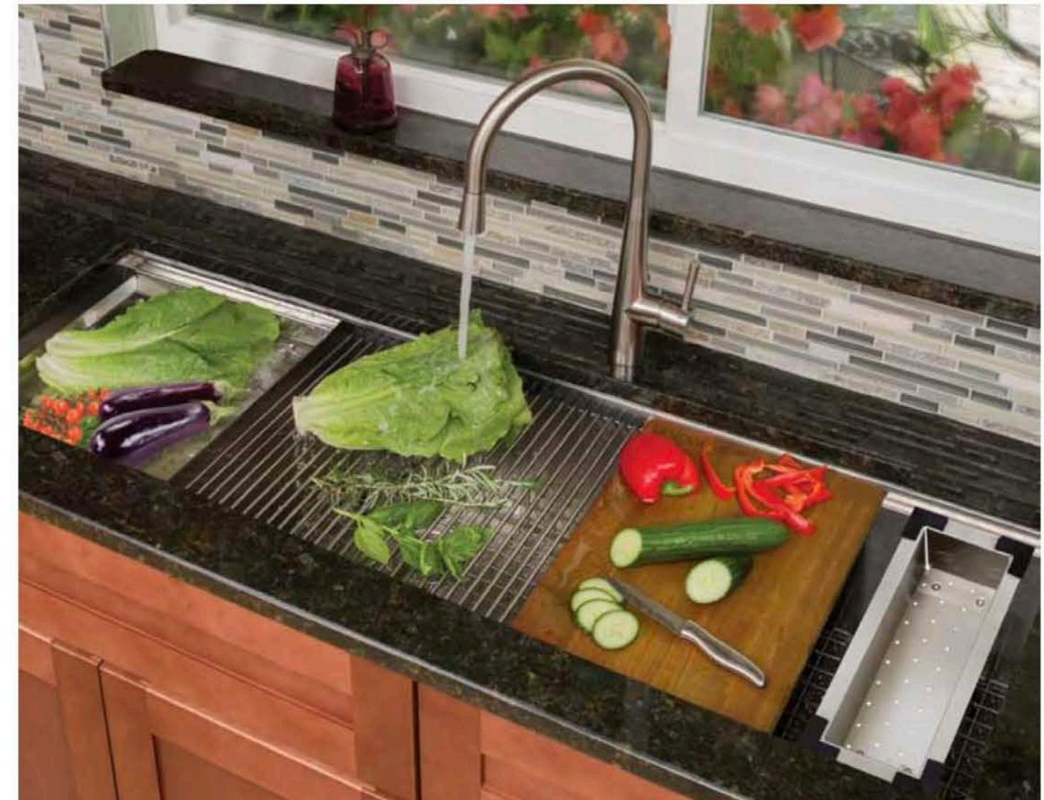
Ultra Ledge Prep Sink from Lenova

The bigger and better Ultra Ledge Sink from Lenova brings expanded functionality to the kitchen as the ultimate prep and clean-up station. Available in 46" and 58" models, this