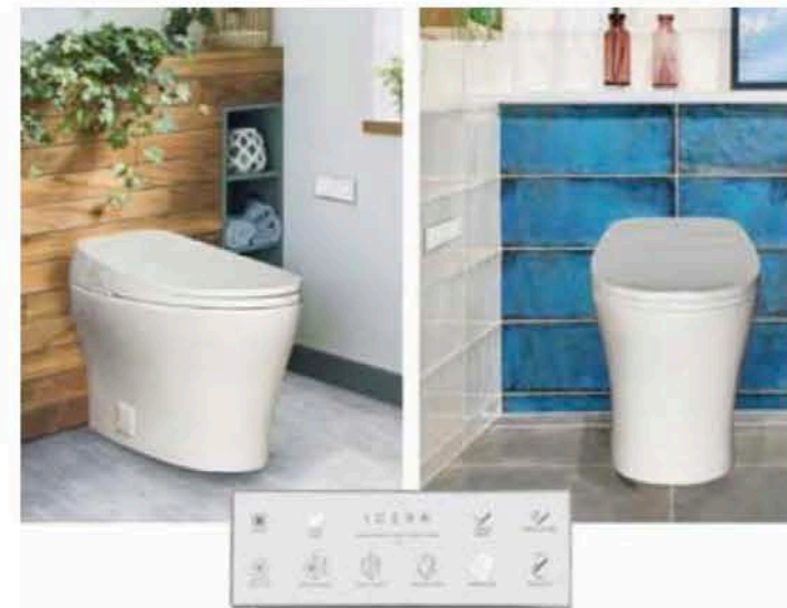
ICERA Muse iWash Integrated Bidet Toilet and remote Muse iWash Integrated Bidet Toilet from ICERA

The Muse iWash Integrated Bidet Toilet offers exceptional cleaning and flushing power while conserving floor space with an efficient two-in-one design. The unit is sleekly