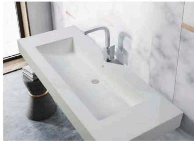
Metropolis Wall-Mount Sink from MTI Baths

As demographics shift and the needs of growing families evolve, Universal Design is growing in popularity and