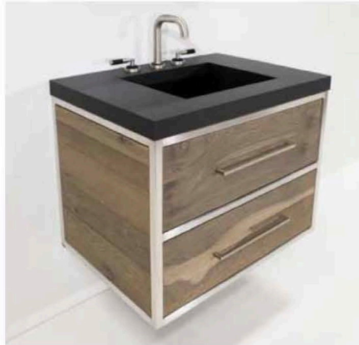
Paxton Vanity from The Furniture Guild

QuickDrain USA makes it simple to convert a tub to a walk-in shower with their ShowerLine system. With a