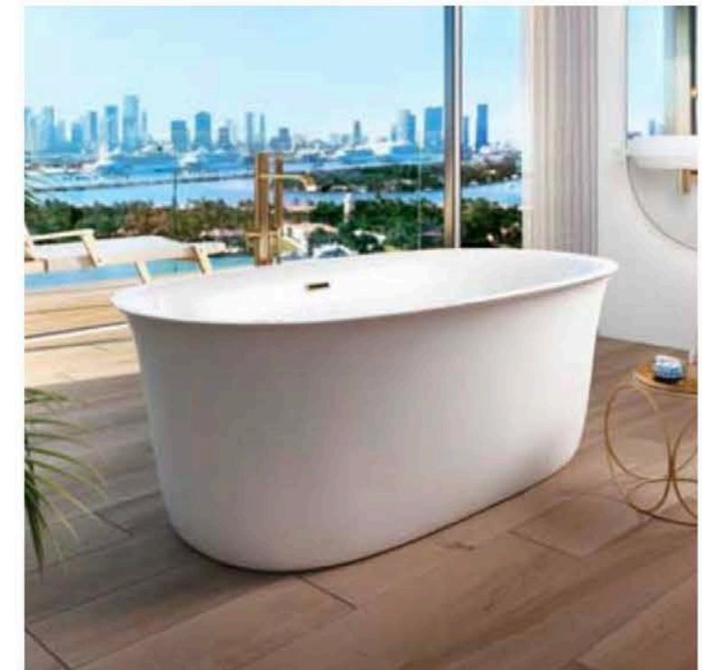
The VIBE 6033 tub from BainUltra

BainUltra has added a new model to their VIBE™ Collection which is designed specifically for urban living spaces and lifestyles. The VIBE 6033 is a deep double-ended freestanding tub with a timeless elegance. Engineered to fit into small bathrooms without compromising comfort or ergonomics, the 6033 is part of the company's Thermomasseur line of therapeutic tubs. This extraordinary bath aims to relax the body, ease pains, reduce stress and eliminate toxins. It offers a full range of BainUltra's signature