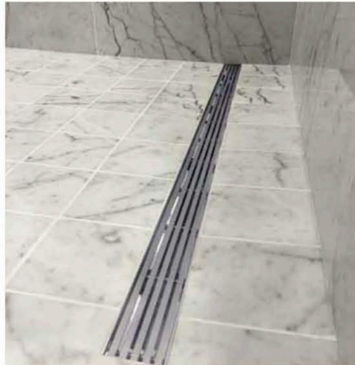
ShowerLine System from QuickDrain USA

highly efficient PVC drain body, the ShowerLine system creates a high-end look at a reasonable price and with no-hassle installation. Created with pre-sloped shower panels made from 100% repurposed materials, ShowerLine offers fast-and-easy retrofit solutions. It's perfect for a bathroom remodel to add a roll-in shower for maximum accessibility. The system offers an array of design options to work with nearly any finish or flooring material and provides a clean, modern look. As an ADA-compliant design, ShowerLine systems are available in six standard sizes and four outlet configurations.