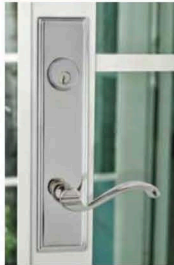
Grandeur Carre Tall Plate with Portofino Handle in Polished Nickel

The Tall Plates Collection by Grandeur Hardware creates a stunning impression with elegant lines, perfect proportions and a lovely selection of finishes. Ideally suited for taller doors, creating a visually pleasing balance with a timeless appeal, the Tall Plates may be paired with any Grandeur knob or lever to create a custom look. The collection includes three distinctive styles – Arc, Carre and Fifth Avenue and are available as Entry Sets with a built-in deadbolt