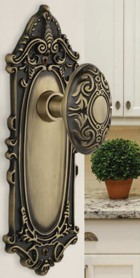
Nostalgic Warehouse's Vintage Collection.

ware and even an antique deadbolt lock. Mix and match different styles from the collection with a choice of knobs, cups, pulls and plates to make a unique finished look. There are even complimentary accessories such as coat hooks, switch plates and outlet covers to complete a cohesive space.