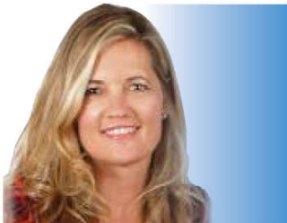
BY LINDA JENNINGS Kitchen & bath specialist

The top trends gaining momentum in our industry.