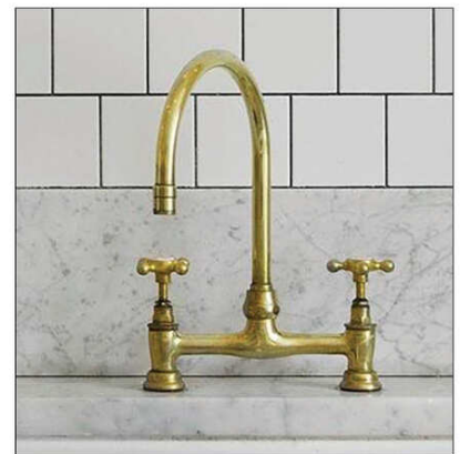
The Regent bridge kitchen faucet in solid brass from Barber Wilsons.

Options range from cabinet hardware to entry sets, interior hard-