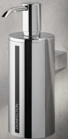
The wall-mounted disinfectant dispenser from Keuco.

Keeping germs at bay has never been more critical. Keuco makes it simple and stylish to keep disinfectants within reach in the bathroom with its wall-mounted dispensers. With a gleaming chrome-plated finish, these chic dispensers keep germ-fighting soaps and gels close at hand, making it easy to use them frequently. The 8.5-ounce capacity is practical for the demands of daily living, and the on-the-wall design helps keep countertops clean and clutter-free. Keuco dispensers are a smart addition to the bathroom to promote cleanliness and streamlined good looks.