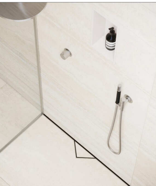
The S-line drain system from Easy Drain by ESS.

Its slim profile is ideal for barrier-free showers and is fully accessible to meet the needs of multi-generational households. The S-line system includes patented technology to ensure watertight performance and easy installation. With a minimalist triangular design and reversible grate, the S-line is a chic choice for today's sophisticated showers.