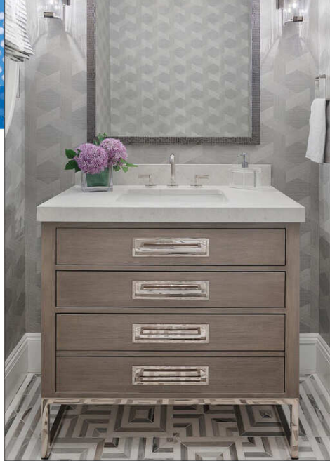
The Edwin vanity from The Furniture Guild, shown here in granite walnut with polished nickel.

practical and beautiful addition to the bath. The Edwin is available in a variety of custom sizes and configurations, with single or double basins, and finished drawer interiors with built-in dividers and organizers. The company builds heirloom-quality pieces