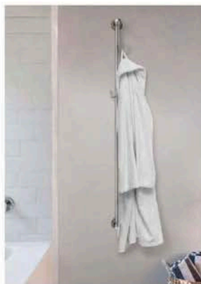
Heated Robe Rails from The Sterlingham Co. Ltd.