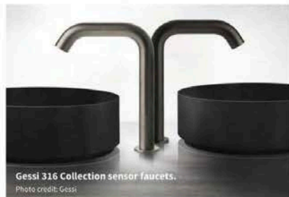
Gessi 316 Collection sensor faucets.

But the company takes brass hardware to a new level with artistic designs spanning an array of styles. From bold, contemporary looks to traditional elegance, there is something for everyone in its design library. Using the latest technology and time-honored techniques, the company produces meticulously de-