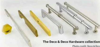
The Deco & Deco Hardware collection.