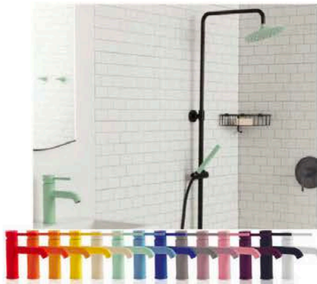
Jaclo’s Color Collection.

Created as part of a $35 million R&D project, this innovative system pairs advanced engineering with cutting-edge technology. Lenova can deliver