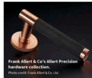
Frank Allert & Co's Allert Precision hardware collection.

Textured metal and mixed finishes are both hot trends in today's