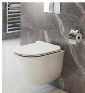
Icera's Lily wall-hung toilet.

Wall-hung toilets are increasingly popular with today's emphasis on smaller spaces, sustainability and minimalist design. Icera delivers on style and with thoughtful details such as DuroPlast silent close seats and an antimicrobial MicroGlaze finish. Each toilet comes with a fully concealed mounting system for a seamless profile and can be easily