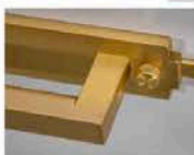
The Furniture Guild’s Avalon vanity with Campaign inlays.