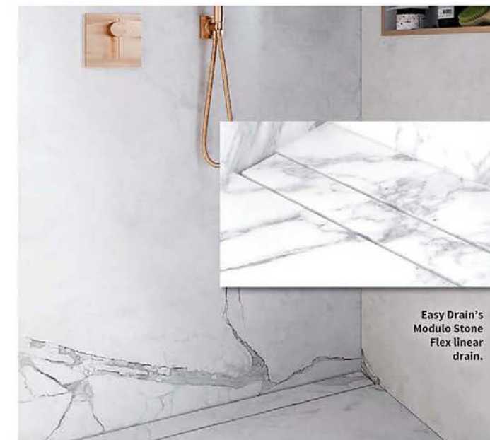
Easy Drain's Modulo Stone Flex linear drain.

Its frameless construction is ideal for wall-to-wall installation jobs with an allowance of up to 4 inches of adjustment on-site. ESS is known for its remarkable blend of Dutch design and German precision, resulting in extraordinary drainage system designs that can transform a shower's function and visual appeal. The Modulo Stone Flex system is offered in a range of lengths from 19 3/4 inches to 82 3/4 inches and is covered by a full 10-year warranty.