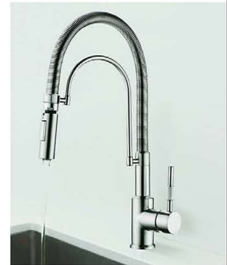
The K503PC faucet from Lenova.

Our industry responded with amazing new product lines to meet those needs. We look forward to seeing what innovations are yet to come as the year unfolds.