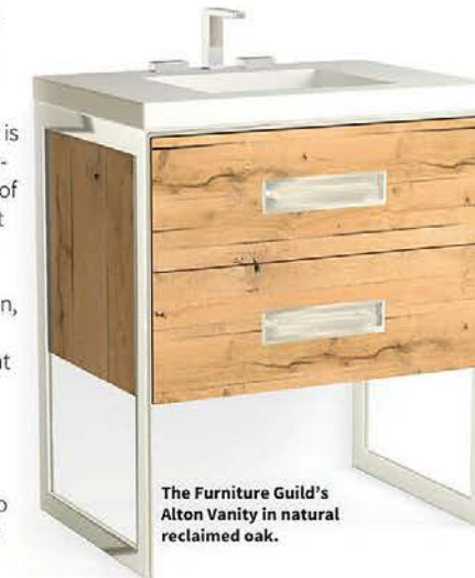
The Furniture Guild's Alton Vanity in natural reclaimed oak.

The combination of wood and metal makes a dramatic style state-