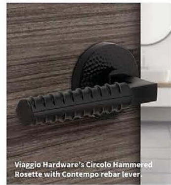
Viaggio Hardware's Circolo Hammered Rosette with Contempo rebar lever.

With remote working here to stay, door hardware needs to keep up. Viaggio Hardware makes it easy to define spaces with extraordinary designs offering plenty of custom options. Its new Motivo Collection is particularly appealing, with textured finishes introducing a tactile element to the décor. Choose from an embossed linen look that is elegant and sophisticated, a distinctive hammered finish for a