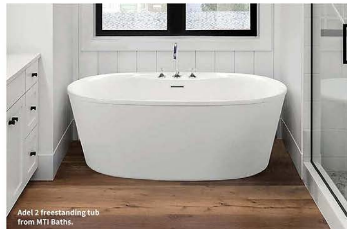
Adel 2 freestanding tub from MTI Baths.

In keeping with MTI's high standards for quality and construction, the Adel 2 is