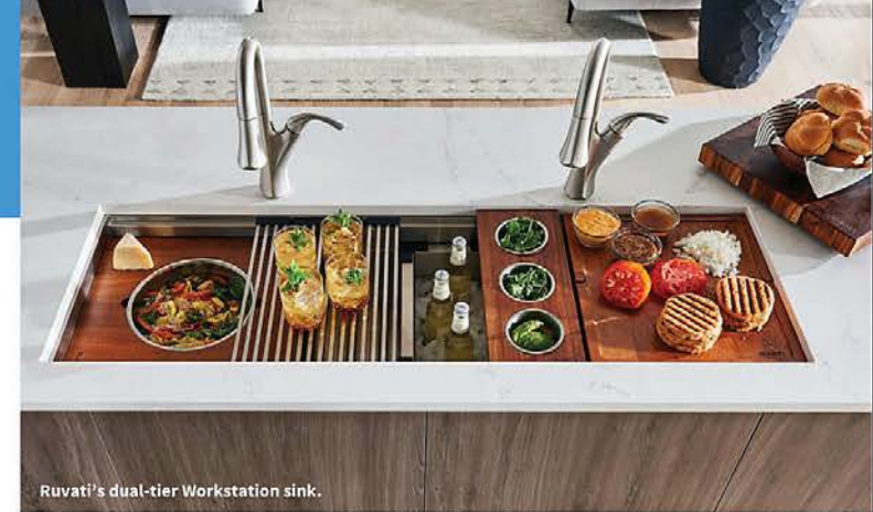
Ruvati's dual-tier Workstation sink.

ment that is earthy yet industrial. The Alton vanity can be customized according to customer preference, from the length, countertop and bowl designs to hardware style and metal accents. The Alton is a smart choice for any décor, packing ample storage into compact spaces for today's multitasking bathrooms.