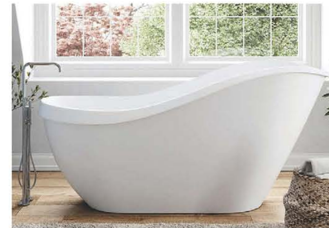
The Serena freestanding bathtub by Acquabella.

It is made in Spain and crafted from Acquabella's signature Dolotek material. With its unique chemical and physical properties, Dolotek makes it possible to mold complex shapes into functional designs and create truly inspired tubs for the bathroom. Measuring 67 inches x 29 inches, the Serena features an included drain, integral overflow and is offered in traditional white as well as shades of gray, brown and black.