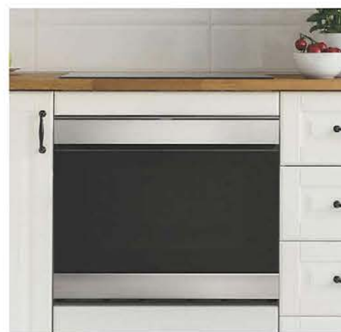
The Smart Convection Microwave Drawer oven from Sharp.