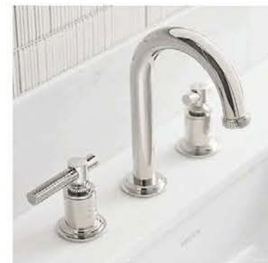
Above: The Central Park West bath faucet from Kallista, in partnership with architecture and design firm Robert A.M. Stern Architects.