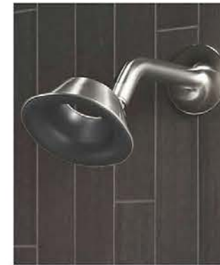
Kohler's Moxie showerhead with wireless, waterproof speaker.

The Bluetooth-enabled speaker can be used in any room of the house — in regular or shower mode — with up to nine hours of playtime per charge. The Moxie package includes the showerhead, speaker, charging dock and charging cable.