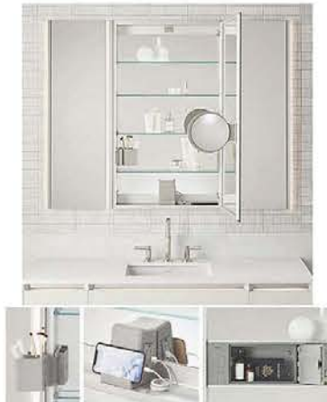
Robern's PL Portray medicine cabinet with made-to-order options.

Interior glass shelves can be adjusted in one-inch increments to easily accommodate must-have grooming products, while a sliding magnification mirror is perfectly positioned and always close at hand. The