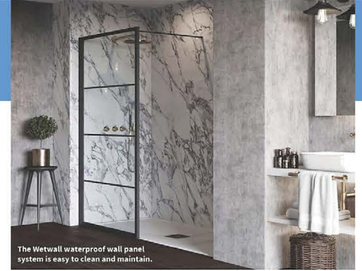
The Wetwall waterproof wall panel system is easy to clean and maintain.