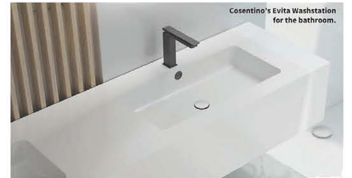
Cosentino's Evita Washstation for the bathroom.