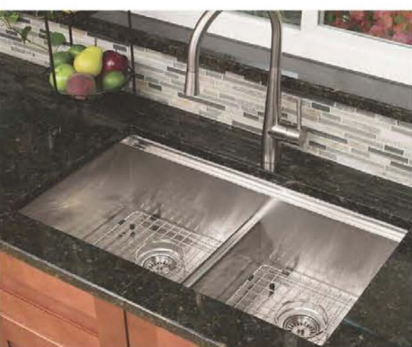
Left: Lenova's Double-Bowl Ledge sink with low divider.