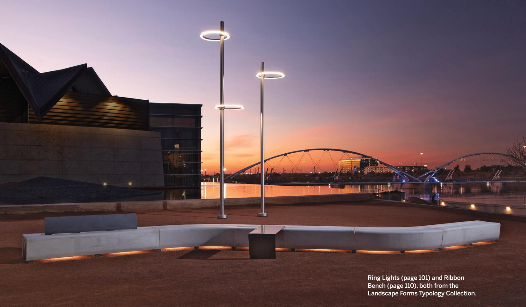
Ring Lights (page 101) and Ribbon Bench (page 110), both from the Landscape Forms Typology Collection.