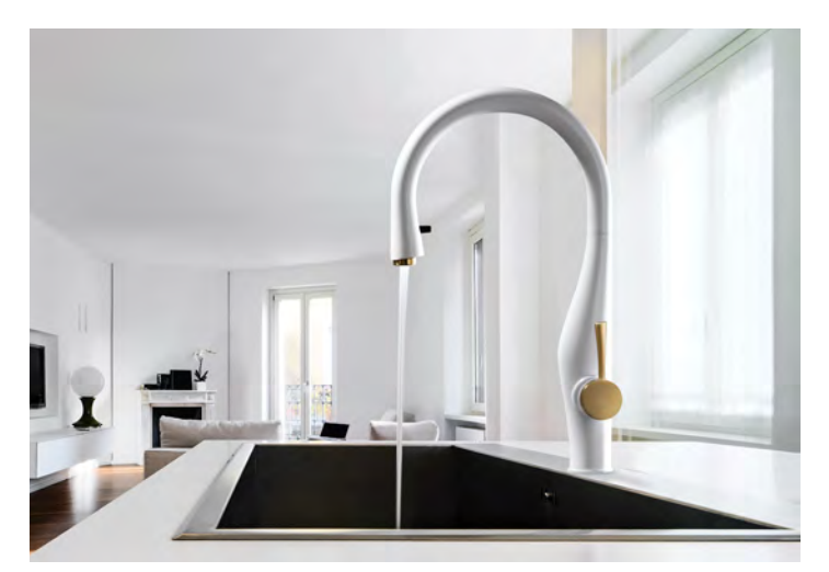
HamatUSA's Imagine Split Finish Faucet

equipment, Nickles is known for design innovation. Their LIPS filler is a whimsical choice for contemporary baths that makes a most memorable style statement.