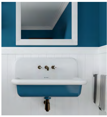
Nantucket Sinks Victorian Collection

sinks feature an elegant backsplash and softly curved silhouette. They are finished in a glossy white or a fun twotone option that pairs white tops with blue, black or grey bottoms. The blue and white combination is a great way to add unexpected color to the bathroom!