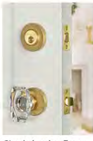
Circolo Leather Entry Set with Stella Crystal Knob

Make a festive first impression by dressing your front door with this elegant clear crystal hardware set from Viaggio