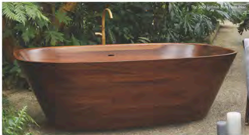
The Shell bathtub from Nina Mair.

freestanding tub translates the past into modern times. BainUltra pairs the traditional circular design of Japanese tubs with its signature air jets to create a powerful yet soothing massage experience unlike anything else in the market. When enjoyed with the brand's signature therapies, BeOne becomes an unforgettable sensory experience.