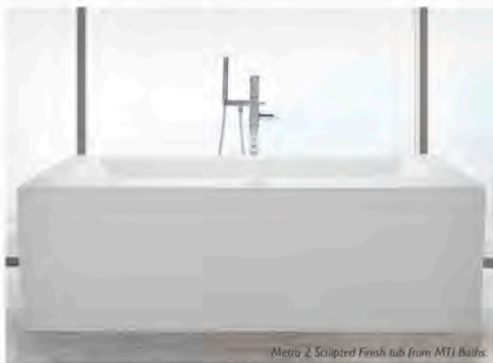
Metro 2 Sculpted Finish tub from MTI Baths.

Series, the Metro tub is made of reinforced cast acrylic and meticulously detailed with a high gloss finish that is nonporous, easy to clean and highly resistant to stains and scratches.