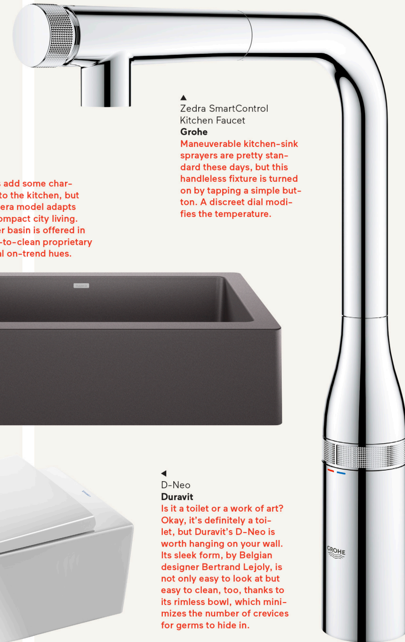
▲ Zedra SmartControl Kitchen Faucet Grohe Maneuverable kitchen-sink sprayers are pretty standard these days, but this handleless fixture is turned on by tapping a simple button. A discreet dial modifies the temperature.