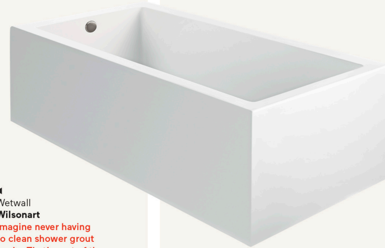
◀ Andrea 12 Sculpted Finish Tub MTI Baths This bathtub features MTI's proprietary DoloMatte material, a solid surface that has a supple texture and is also mold- and mildew-resistant.