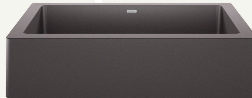
▼ Vintera Blanco Apron-front sinks add some character—and bulk—to the kitchen, but Blanco's new Vintera model adapts the concept for compact city living. The sleek, slimmer basin is offered in Silgranit, an easy-to-clean proprietary material, in several on-trend hues.