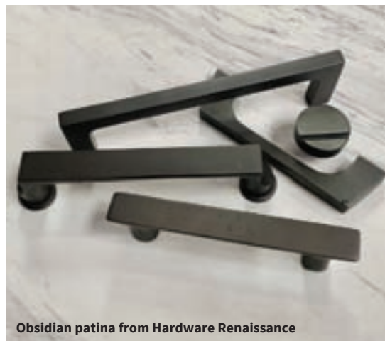
Obsidian patina from Hardware Renaissance

Hardware Renaissance takes pride in the craftsmanship of its authentic hand-forged iron and modern bronze hardware, all notable for custom detailing, inlays and patinas. They are the antithesis of mass production, instead carefully fashioning every knob, pull and lever by hand according to customer orders. Drawing inspiration from cultures around the world for its designs, Hardware Renaissance creates its sustainable masterpieces in New Mexico, relying