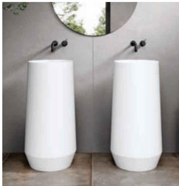
Acquabella Venet Totem sink