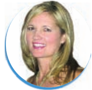
BY LINDA JENNINGS Kitchen & Bath specialist

German engineering and Dutch design, EasyDrain products feature innovative TAF technology and a signature water protection system for a watertight fit and effective water removal, all backed by a 10-year warranty.