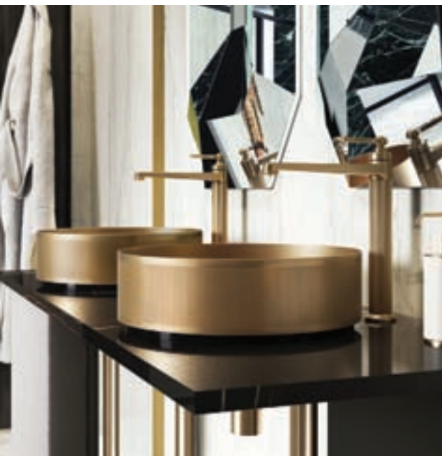
Venti20 Collection high sink mixer from Gessi North America

Modular appliances can be freely positioned to create distinct areas for cooking, meal prep and cleanup. Options include pizza ovens, wine coolers, warming drawers, ice-makers, beer dispensers and much more. Create a custom kitchen that will become the epicenter of