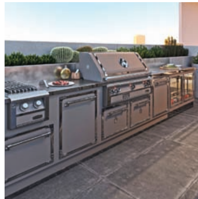
Officine Gullo outdoor kitchen