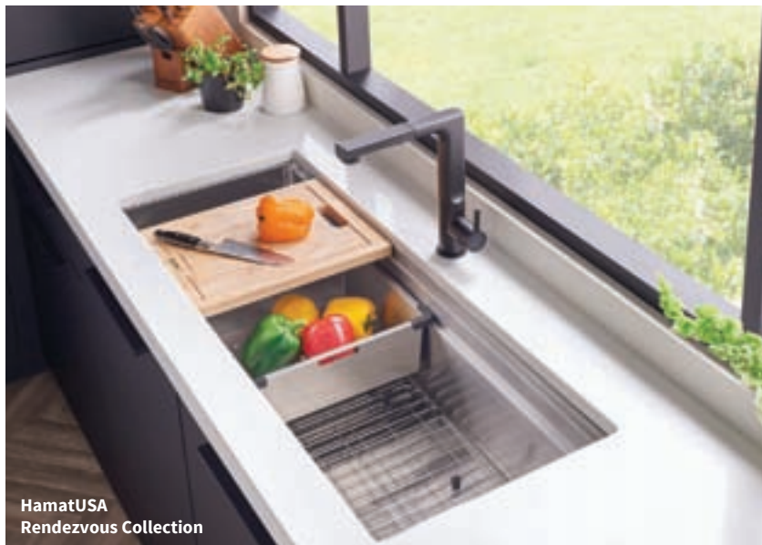
HamatUSA Rendezvous Collection

alfresco entertaining, from breakfast coffee and casual luncheons to poolside cocktails and dinner parties under the stars. Designs are fully customizable, even down to colors and metallic finishes.