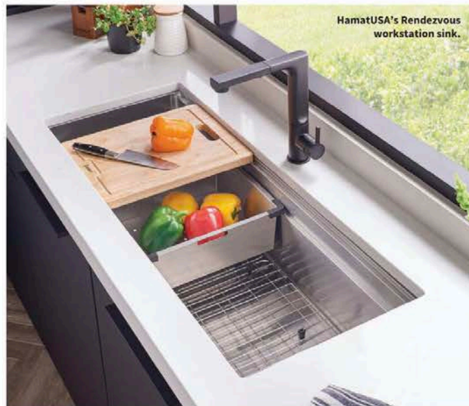
HamatUSA's Rendezvous workstation sink.

No detail is overlooked; even screw mechanisms are carefully hidden with the company's concealed screw mechanism for a seamless installation. Viaggio Hardware is crafted in the heart of Europe using a singular combination of expert engi-