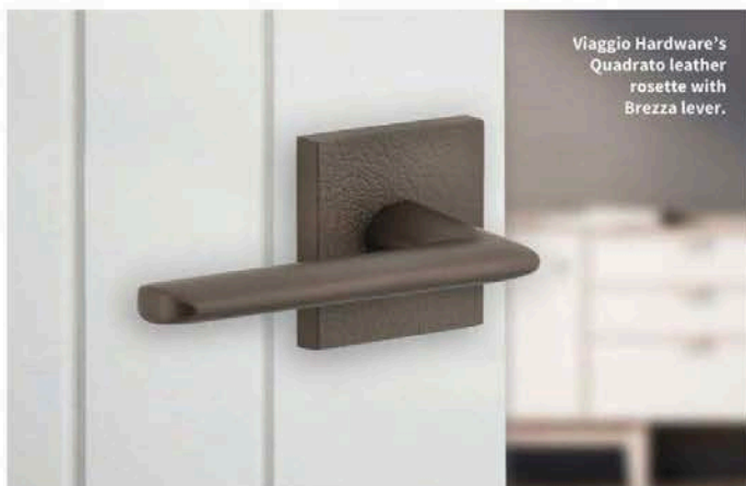
Viaggio Hardware's Quadrato leather rosette with Brezza lever.

MAXIMIZE THE POWER OF THE HOME WITH DESIGN CHOICES THAT PROVIDE THE GREATEST SENSE OF WELCOME AND COMFORT.