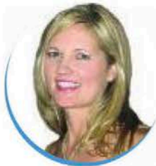
BY LINDA JENNINGS Kitchen & bath specialist

Express your style with these new kitchen and bath trends.