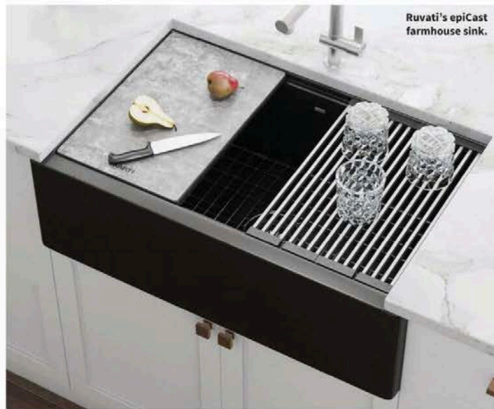
Ruvati's epiCast farmhouse sink.