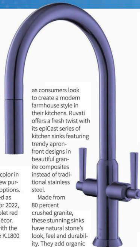
Isenberg's Velox faucet with Very Peri purple color.

Ruvati builds its epiCast sinks with thick, solid construction that is naturally sound-absorbing and resistant to scratches and extreme temperatures. The sinks come with integrated ledges and accessories to enhance functionality and are covered by a limited lifetime warranty.