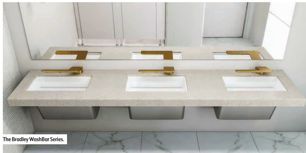
The Bradley WashBar Series.