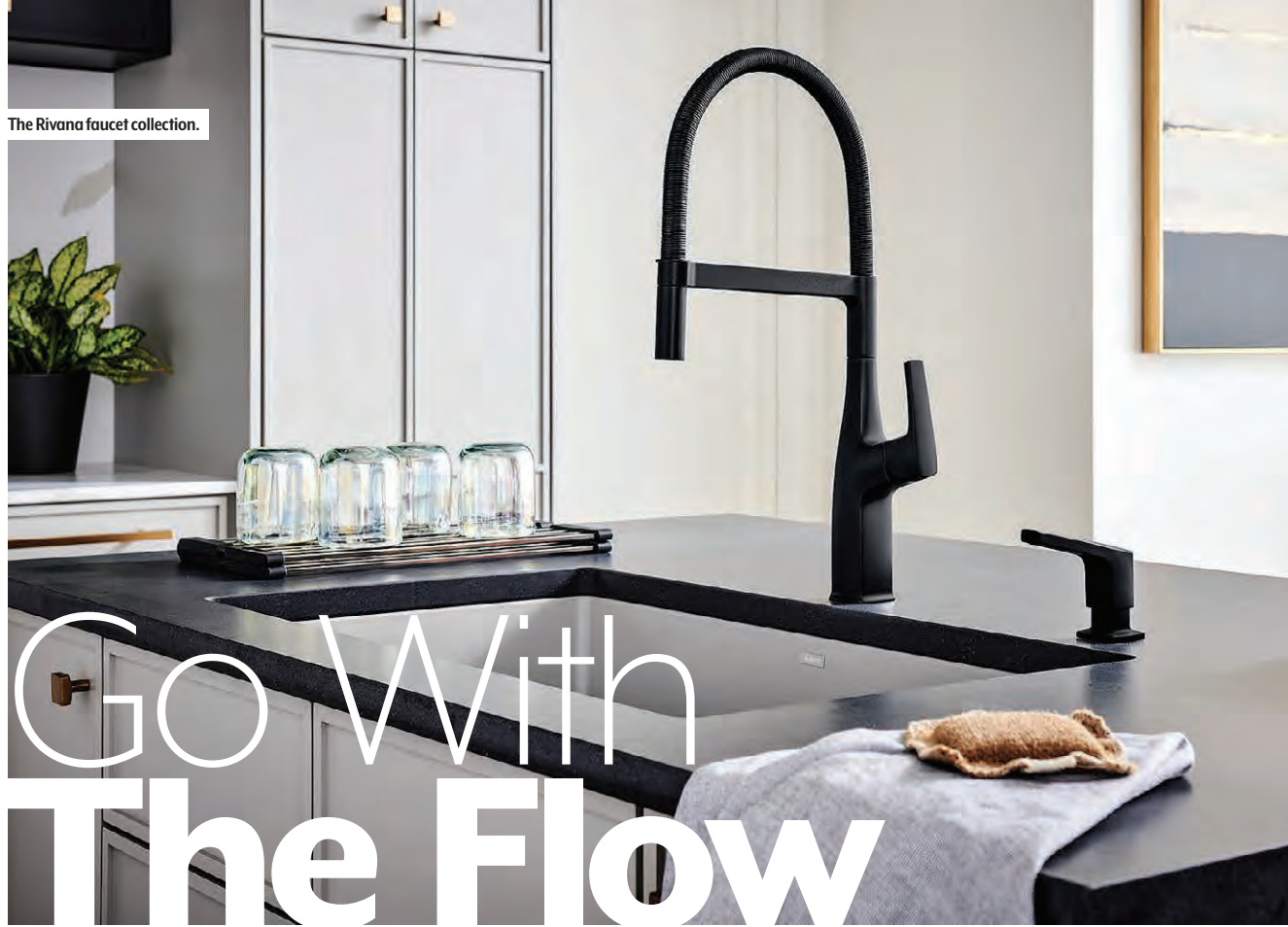
The Rivana faucet collection.