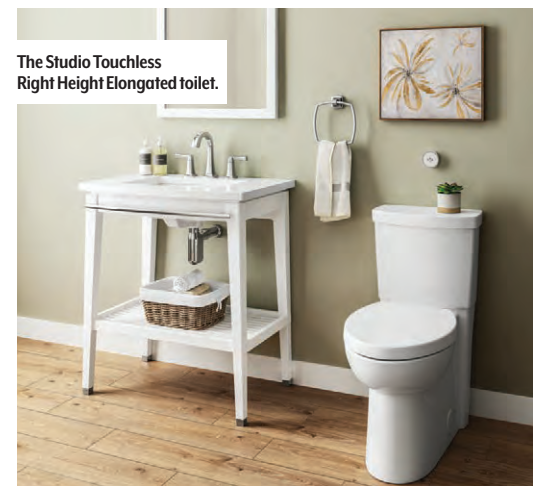
The Studio Touchless Right Height Elongated toilet.

The affordable price belies the upscale features, such as a heated seat, auto open and close, and intuitive remote. A big benefit for homeowners looking for DIY projects, the Innate toilet offers Kohler’s ready-lock installation.