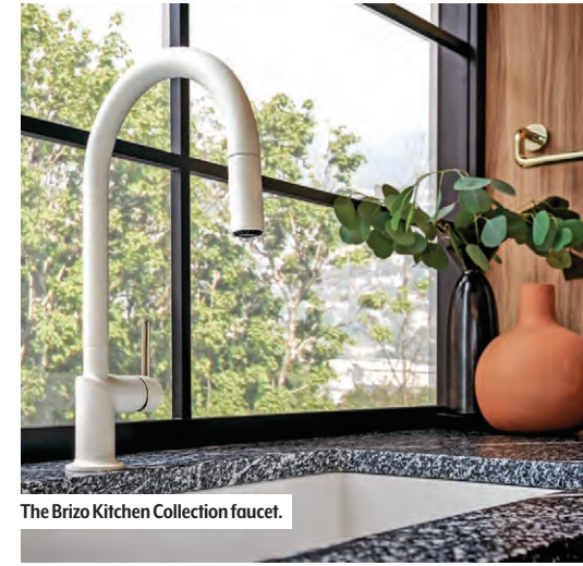
The Brizo Kitchen Collection faucet.

M anufacturers of plumbing products, from baths and decorative faucets to kitchen spray heads, are all bringing the latest designs and technology to the forefront, giving builders and interior designers a plethora of options.