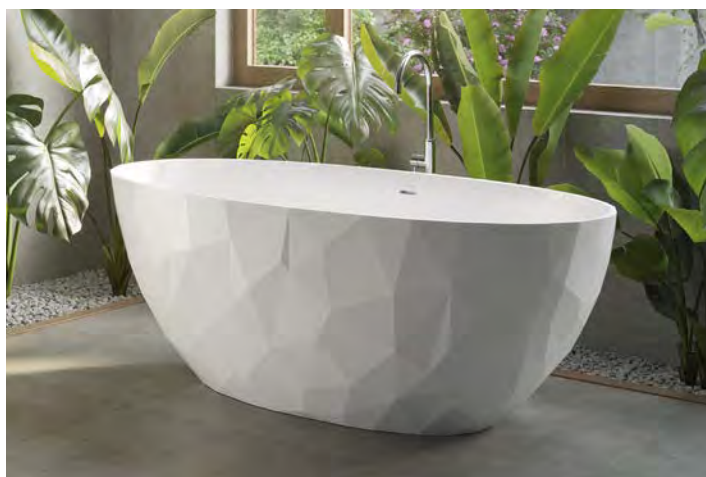
Acquabella Stelvio freestanding bath

white geometric prism. These new luxury builder products are an excellent representation of refined designs, intuitive finishes and exceptional materials sure to add classic sophistication to your dwelling space. Now is the time to embark on a new era of home design with these forever pieces.