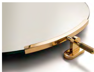
Sterlingham Company's Industrial Mirror

The industrial look continues to be in hot demand with consumers and designers alike clamoring to achieve the urban-inspired vibe. The new Industrial Mirrors by Sterlingham Company Ltd. are a wonderful addition to any design space hoping to create this classic style. Available in round, oval and rectangular designs, these mirrors feature lathe-formed parts with knurled detailing perfect for an industrial theme. The mirrors are made from a high quality 6mm thick mirrored glass that is held securely in place with wall brackets at the top and bottom. The brackets are offered in a selection of 16 finishes including Gun Metal, Brushed Brass, Polished Nickel and Matte Black. In keeping with the brand's reputation for exceptional quality and craftsmanship, all components are polished by hand before assembly, and each mirror is meticulously inspected before and after electroplating to ensure a perfect finish. The Industrial Frameless Mirror is a defining style element in any room, from the bedroom or bathroom to the living room or hallway.