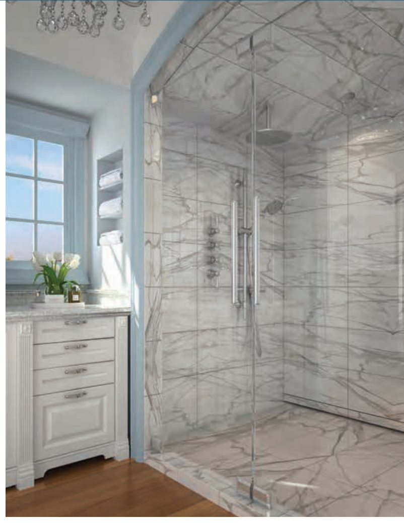
L.R. Brands by Oatey's QuickDrain WallDrain in marble

QuickDrain (part of Oatey's newly launched L.R. Brands) beautifully integrates water drainage into modern showers. The