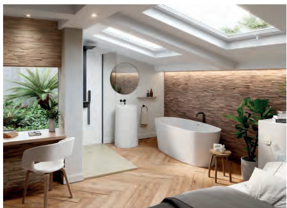
Aquabella brings serenity and simplicity to your bathroom with sinks and bathtubs that personify elegance and simplicity.

Anthem is Kohler's next level DVT product. The digital thermostatic valve (DVT) provides precise temperature control. The Anthem system completes the showering experience by integrating not just water, but also sound, steam and light. A favorite feature of Anthem is Bluetooth connectivity, which allows users to play music or sounds for whatever experience is desired. Voice activation is optional, and a touch screen allows the user to add music with MP3 player, add light and more. Kohler Konnect® allows connectivity with Siri or Alexa.