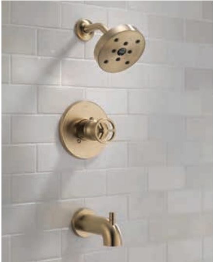
Left: The Monrovia Kitchen Faucet Collection with Delta® Touch2O® Technology is a touch-enabled faucet. Right: Delta's Trinsic Bath Collection with Lumicoat finish. Shown in Champagne Bronze.

line includes linear and square drains in a range of styles to complement bathroom design. And, believe it or not, Matte Black is a favorite finish trend for drains.