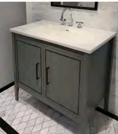
ABOVE: The Furniture Guild's Lydia vanity.