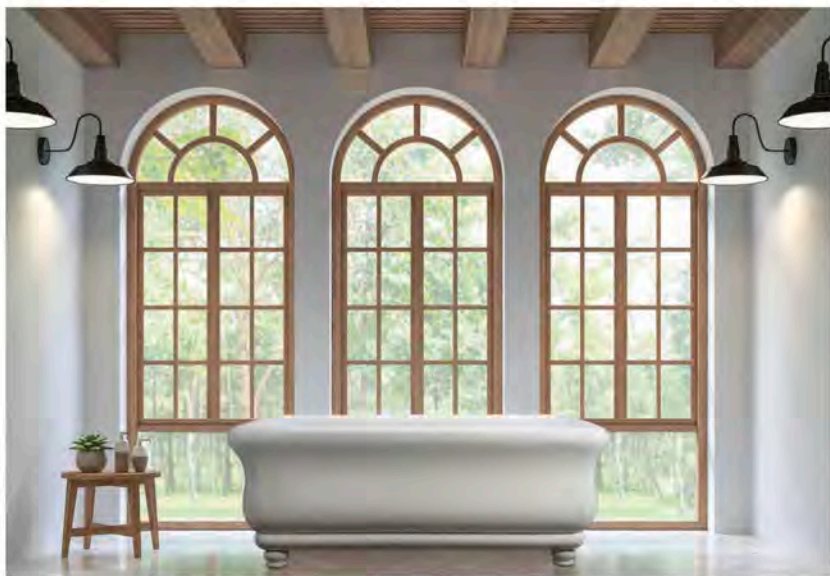
MTI Baths' Parisian 2 freestanding tub with bun feet.

TRANSITIONAL STYLE IS ALWAYS CURRENT AND ON-TREND, YET IT ALSO RECALLS PREVIOUS STYLES AND PAST GENERATIONS.