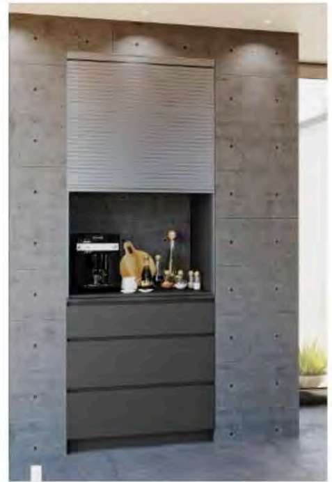
With smaller spaces in the work environment and sleeker, more practical design trends in retail and commercial spaces, REHAU tambour door systems offer a streamlined look combined with functionality and additional storage.