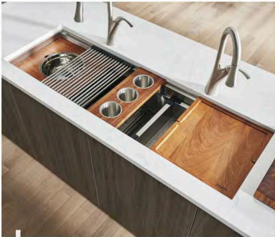
Ruvati 57-inch workstation two-tiered ledge undermount sink.