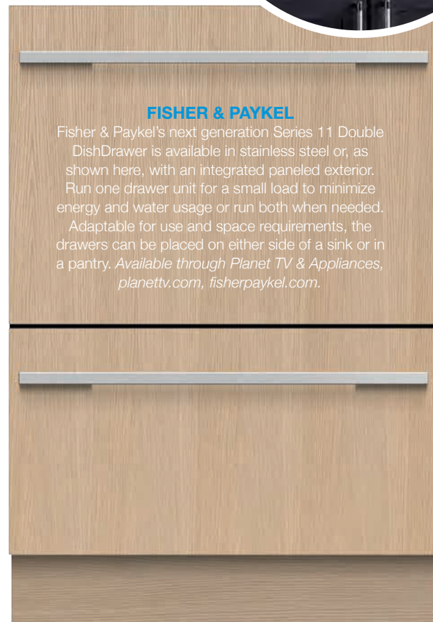
NEW SCHOOL MODERN: GEORGE ROSS

Fisher & Paykel's next generation Series 11 Double DishDrawer is available in stainless steel or, as shown here, with an integrated paneled exterior. Run one drawer unit for a small load to minimize energy and water usage or run both when needed. Adaptable for use and space requirements, the drawers can be placed on either side of a sink or in a pantry. Available through Planet TV & Appliances, planettv.com , fisherpaykel.com .