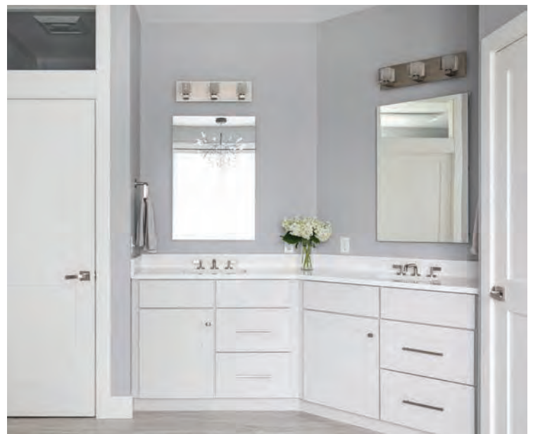
BELOW Although the vanities are tucked into angled walls, they offer maximized storage and counter space thanks to recessed medicine cabinets.