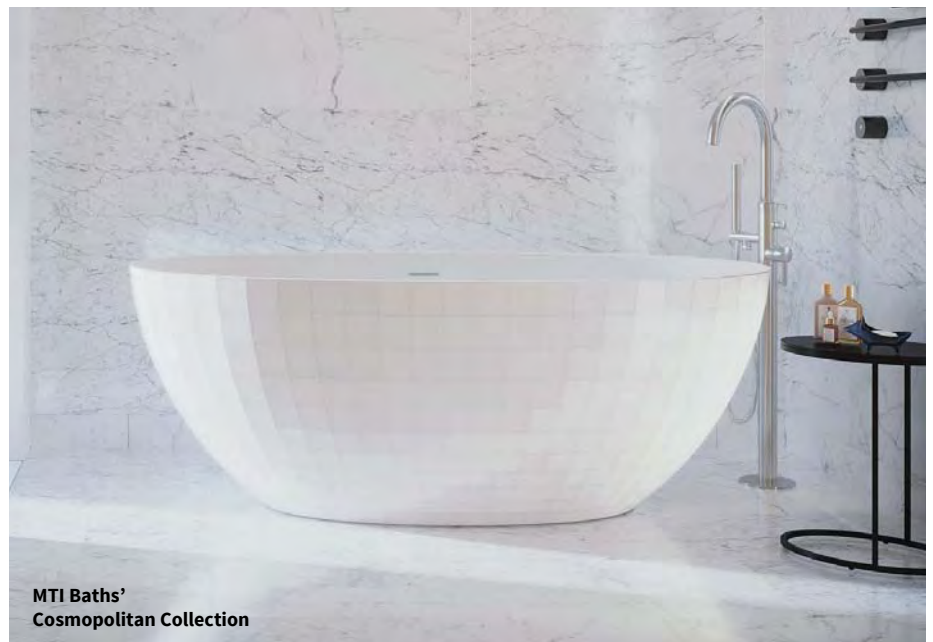
MTI Baths' Cosmopolitan Collection

MTI offers the collection in a beautiful glossy white finish or with optional exterior matte finishes in white, gray or black.