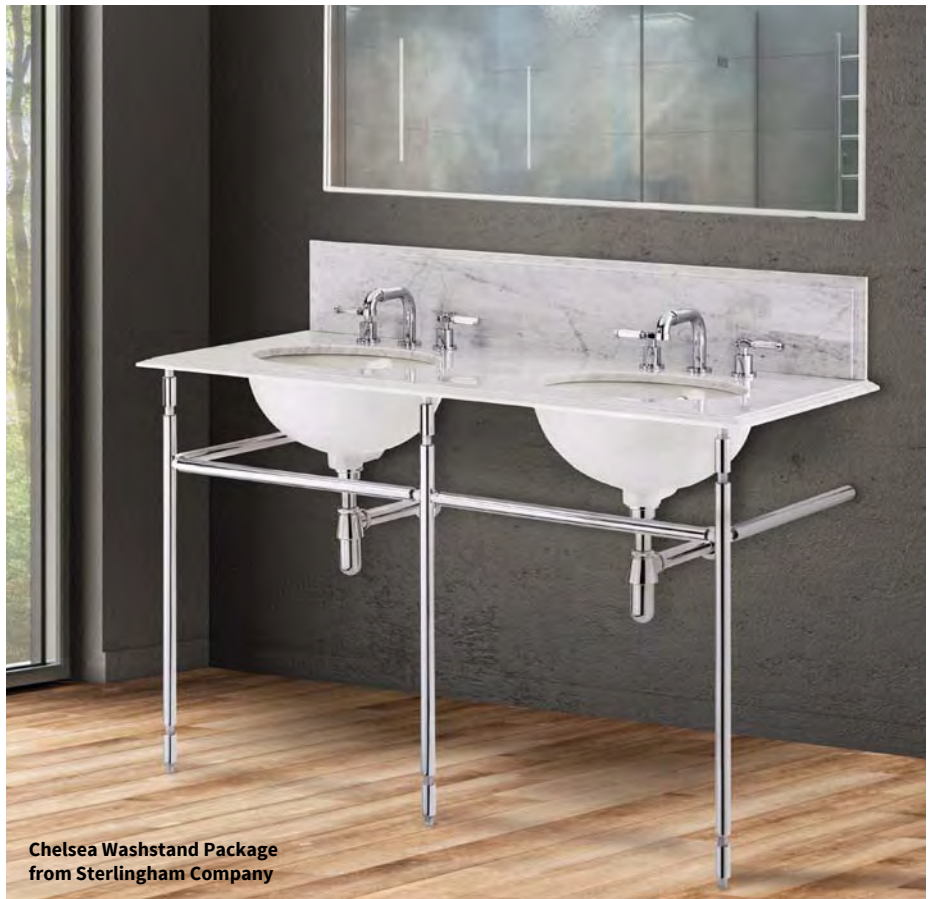
Chelsea Washstand Package from Sterlingham Company

The Sterlingham Co. debuts a new lineup of sleekly engineered washstand packages. Crafted from solid brass, these artisan-quality washstands feature a stunning marble