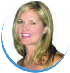
BY LINDA JENNINGS Kitchen & bath specialist

These products are excelling in the luxury market.