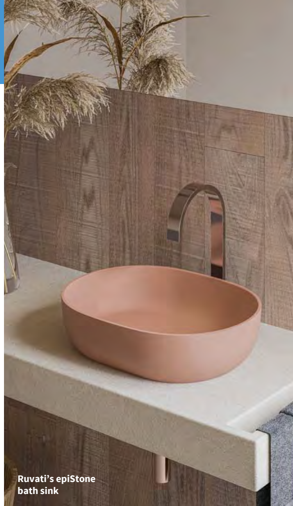
Ruvati's epiStone bath sink

The new Cosmopolitan Collection from MTI Baths is the epitome of luxury design for the bathroom with its sophisticated style and streamlined sensibility. There's a twist — it's affordable. The line includes 14 show-stopping freestanding tubs and eight distinctive complementing sinks. Plus, an innovative line of shower bases in different organic textures and colors. Shower floors reimaged.