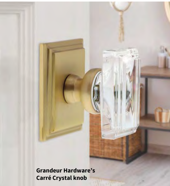
Grandeur Hardware's Carré Crystal knob