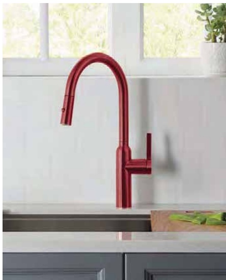
The Ziel 1360 from Isenberg Faucets

Acquabella ushers in a new era of bathing with its asymmetrical freestanding tub