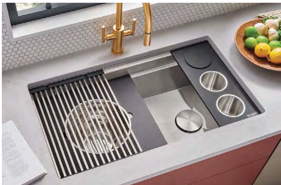
Ruvati's Dual-Tier Nova workstation sink

creation, the Serena. A softly contoured tub with graceful curves inspired by undulating ocean tides, this beautiful bath is a brilliant pairing of traditional elegance and modern innovation. Measuring a generous 67 inches by 29 inches by 32 inches, Serena has been thoughtfully designed to cradle the bather in singular comfort.