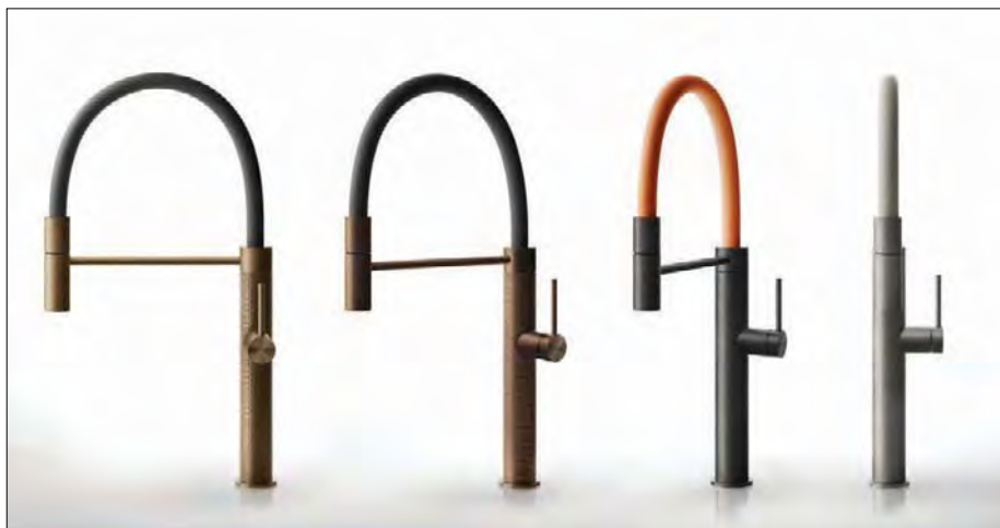
Gessi's 316 kitchen faucet collection

Standard finishes include polished brass, polished chrome, polished or matte nickel, antique gold, copper and various