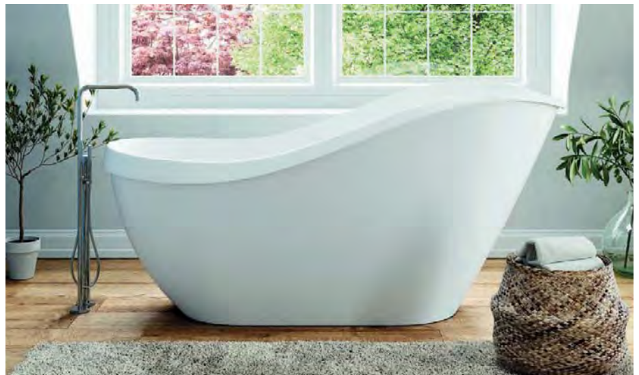
Acquabella's Serena bath