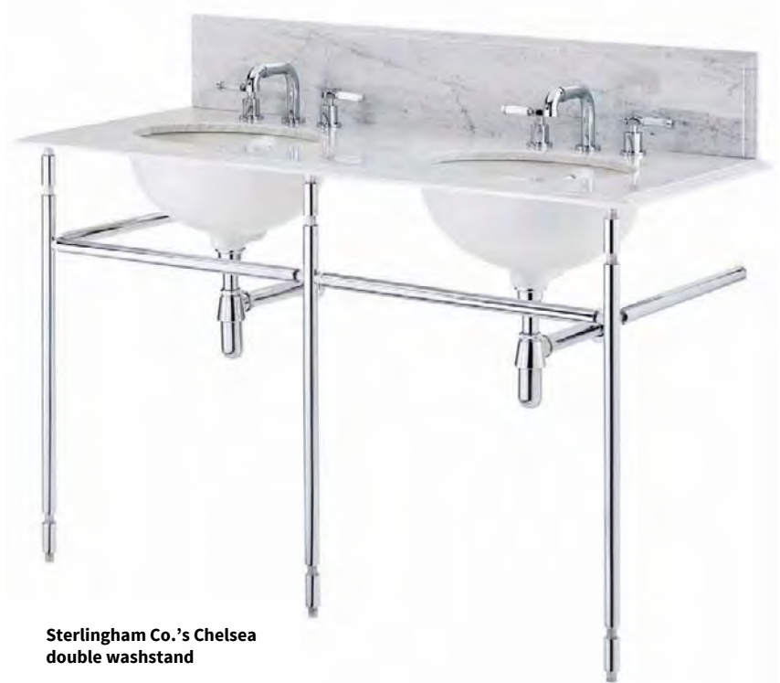
Sterlingham Co.'s Chelsea double washstand