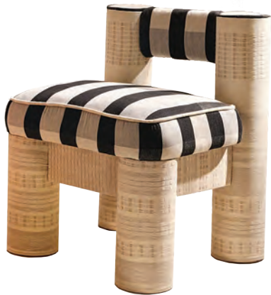
MINNA X LIKEMINDEDOBJECTS CRCL Chair Black & White