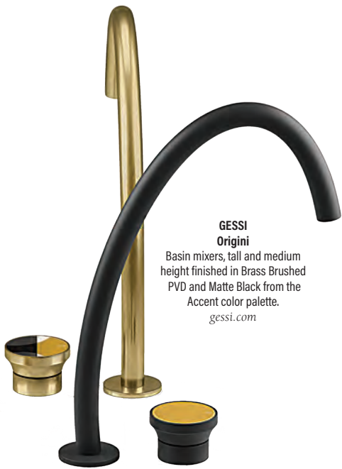
GESI Origini Basin mixers, tall and medium height finished in Brass Brushed PVD and Matte Black from the Accent color palette. gessi.com