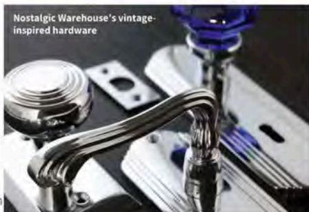
Nostalgic Warehouse's vintage-inspired hardware