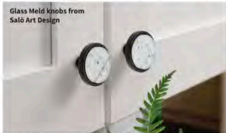
Glass Meld knobs from Salò Art Design

Learn more about these products by visiting these websites: