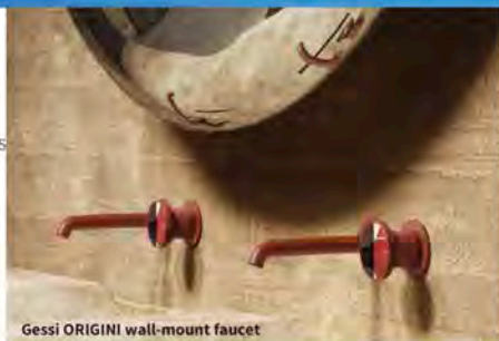
Gessi ORIGINI wall-mount faucet

These are investment pieces that are built to last and bring beauty to their surroundings for years to come. We look forward to continuing our design search in the months ahead. ♡