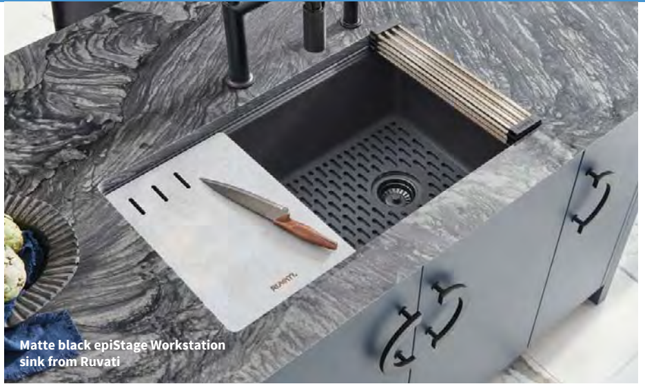
Matte black epiStage Workstation sink from Ruvati