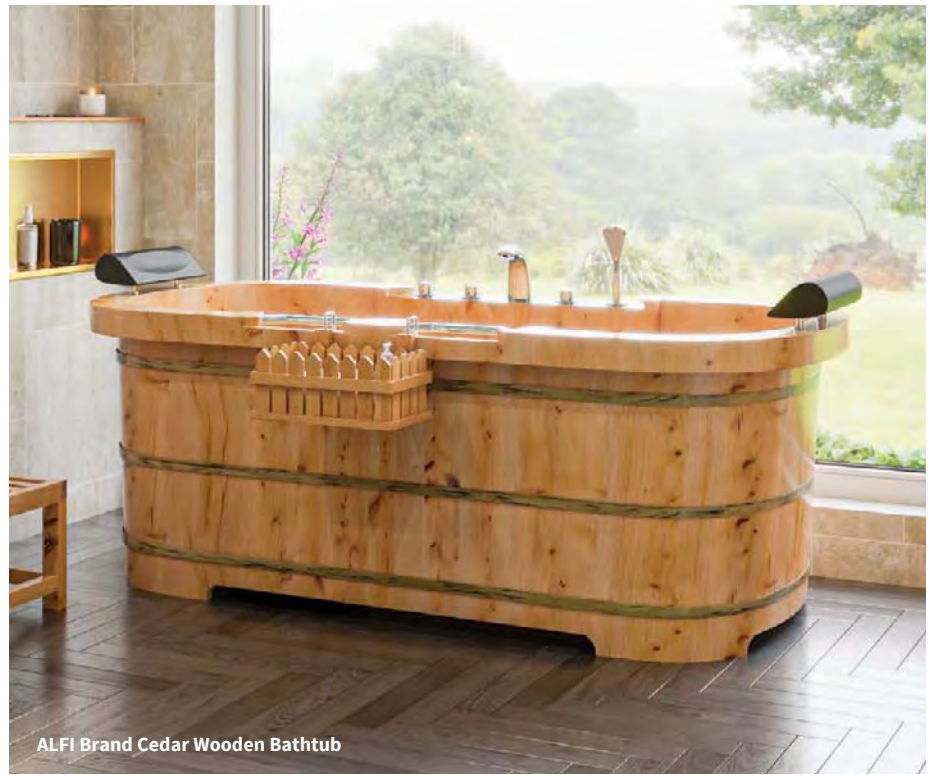
ALFI Brand Cedar Wooden Bathtub

Each sink is colored all the way through for a rich, durable look that will never fade or stain and is easily maintained. The collection includes 30-inch and 33-inch sinks and offers options for topmount and undermount installation. Integrated ledges permit the included accessories to slide into place as needed, allowing prep work to be done over the sink and freeing up valuable counter space.