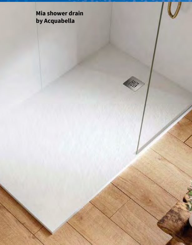
Mia shower drain by Acquabella