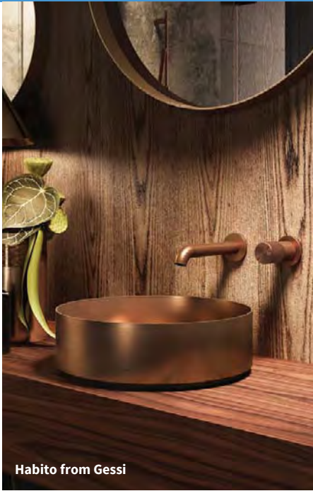
Habito from Gessi