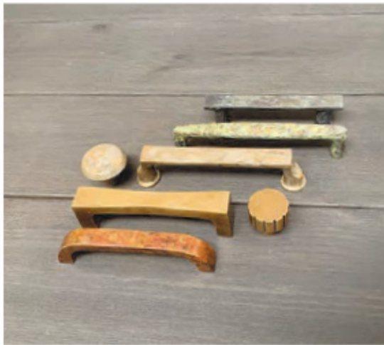
FINISH LINE Hardware Renaissance has reimagined its solid-bronze decorative collection in a range of artisan-made finishes accented with color, veining and highlights. Hand-applied patinas (left) adorn an assortment of knobs, pulls and levers. hardwarerenaissance.com