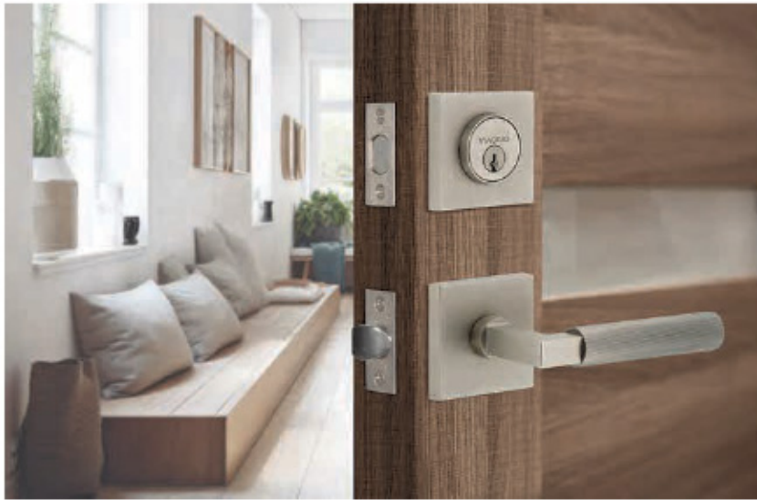
TACTILE SURFACE Linear grooves embellish the Fluted Lever, a new addition to Viaggio Hardware's Contempo Collection. Forged from brass, the handle comes in five finishes (Satin Nickel is pictured) and boasts a concealed screw mechanism for a seamless look. viaggiohardware.com