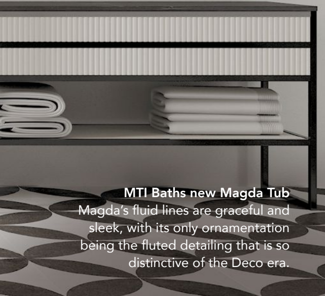
MTI Baths new Magda Tub Magda's fluid lines are graceful and sleek, with its only ornamentation being the fluted detailing that is so distinctive of the Deco era.