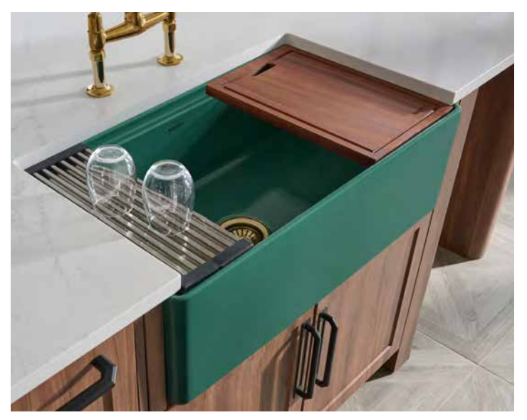
Ruvati's workstation sink in Emerald Green

with brands that offer classic designs, quality and a personality that enlivens the dwelling space. Celebrate the season with these show-stopping products that are sure to make your remodeling project or new home build a huge success!