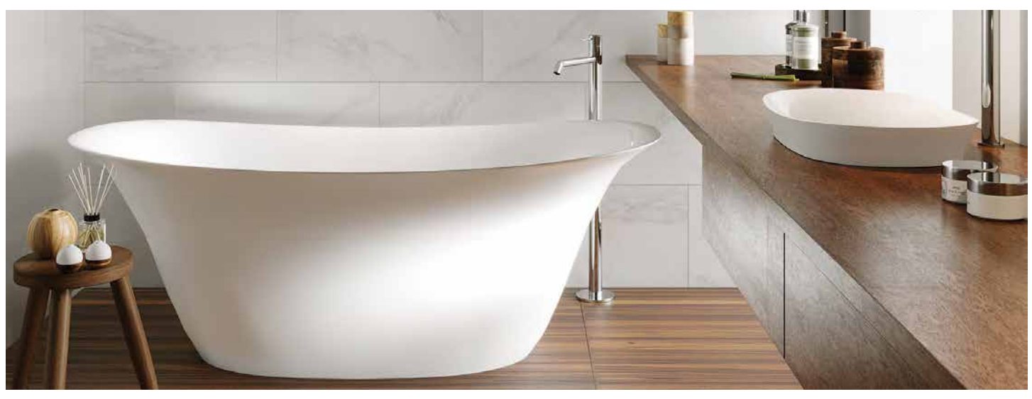
MTI Baths' Maricela tub