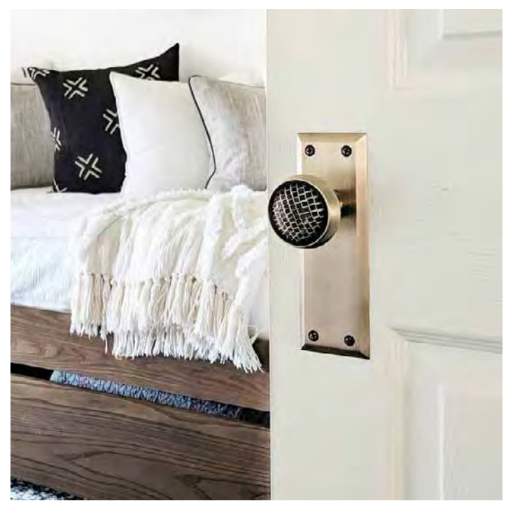
New York Long Plate with Craftsman Knob in Antique Brass from Nostalgic Warehouse