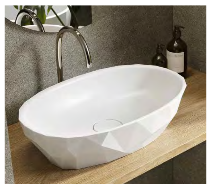
Stelvio Vessel Basin by Acquabella

Reimagine your kitchen and bath with these great new blooms of fixtures and fittings. From a bold, verde color-infused kitchen sink to a stunning geometric basin available in a palette of exterior matte colors for a fresh and modern look! Create your own home aesthetic