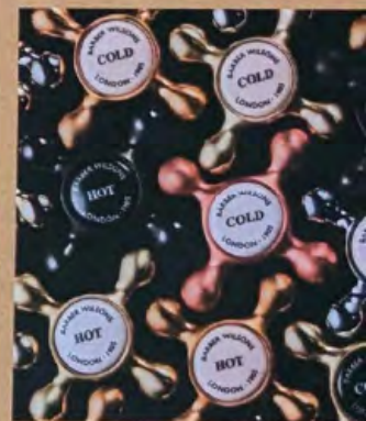
TOP (left) A wall-mounted, levered kitchen tap in an unlacquered, polished brass finish. * (right) Jem Bigland bought Barber Wilsons, now entering its 120th year, when it was in danger of closing due to real-estate pressure. LEFT (center) A bath tap in the 1890s Regent style, at the luxurious Limewood Hotel in Hampshire, outside of London. * (bottom) A faucet spout being shaped with heat. INSET Regent Series cross handles with hot and cold shields (buttons), shown in a few of Barber Wilsons’ 18 finishes.

Barber Wilsons also proudly refurbishes taps that were made by the company at any point in its history. Many fittings are still functional but need a spit-and-shine to bring them back. “From a sustainability perspective . . . we love doing that. People are very much attached to their taps, but they want them to be fresh again.” —MARY ELLEN POLSON